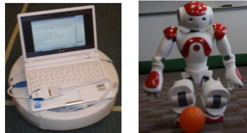
(a) iRobot Create

Our work has focused on off-the-shelf systems that are available for purchase by other research groups. While much of the work in the Brown ROS Package can be used on any platform running ROS, we also provide drivers for two widely-available platforms: the iRobot Create and the Aldebaran Nao (pictured in Figure 1).